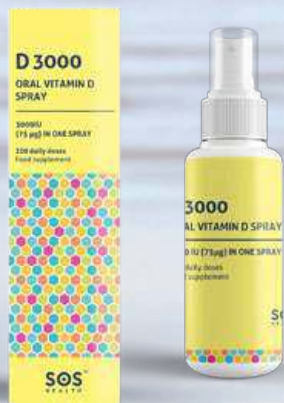
Vitamin D3 Sprays