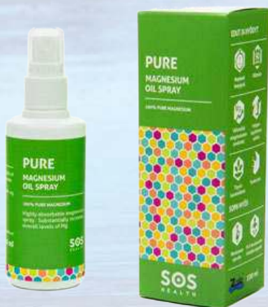
Magnesium Oil Sprays